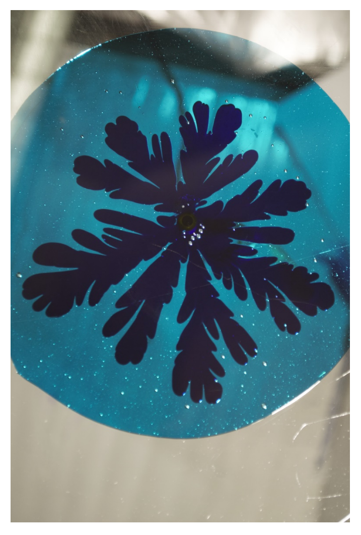
Figure 2 - Unedited Get Wet image

The field of view in this image is about 5 inches by 8 inches with pixel dimensions of 2848x4287. The photo was taken with the camera about 8 inches away. The lens used was just the stock lens that came with the camera. It has a focal length of 18-55 mm and a focus distance of 0.8 ft to infinity. For this image, a shutter speed of 1/50 s, an aperture f-stop of f/5.6, and an ISO setting of 200 were used. These values are the ones the camera picked automatically. I know it's possible to get cooler pictures by tweaking those values, but it seems that when I try to do it the image just gets worse than the automatic settings. Therefore, I decided to just let them be.