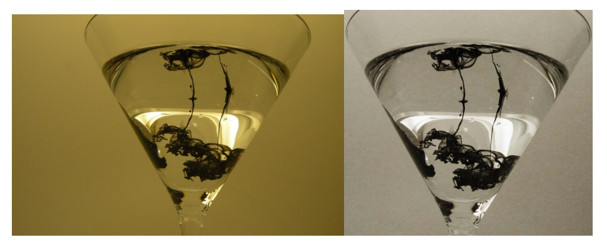
Figure 2: Left: Original image, Right: Final image

excessive background, so the image was also cropped slightly. I also de-colorized the image, thinking that it added to the simplicity and drama of the shot.