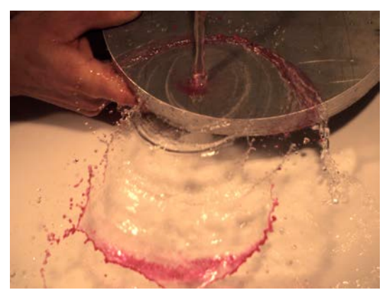
Figure 1: Setup used for my Image

Later in the experiment we set the metal plate on a metal basket in the sink and let the faucet flow over this, while dropping the India ink, which can be seen in Figure 2. Some of the other images submitted by my group used this experimental setup, and it can be seen that another metal plate was used as the background as opposed to the white poster board.