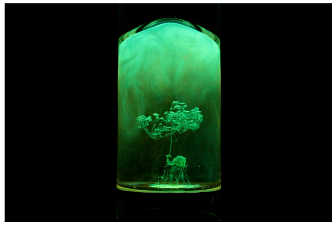
Figure 2: Original Image

Overall, I'm very satisfied with how this image turned out. The original image (Figure 2) had a lot of black space, so I cropped the image down to just focus on the glass. The only other thing that was altered was the sharpness, to really bright out the phenomenon clearly. The fluid physics are shown fairly well, including different stages of the instability to show a fluid progression through time. To me, the image looks like an elephant head holding an umbrella in its trunk. I especially like this image because it's open to interpretation such as that. To develop this idea further I could use a more sophisticated setup, including more colors, to better capture this phenomenon in an even more stunningly visual way.