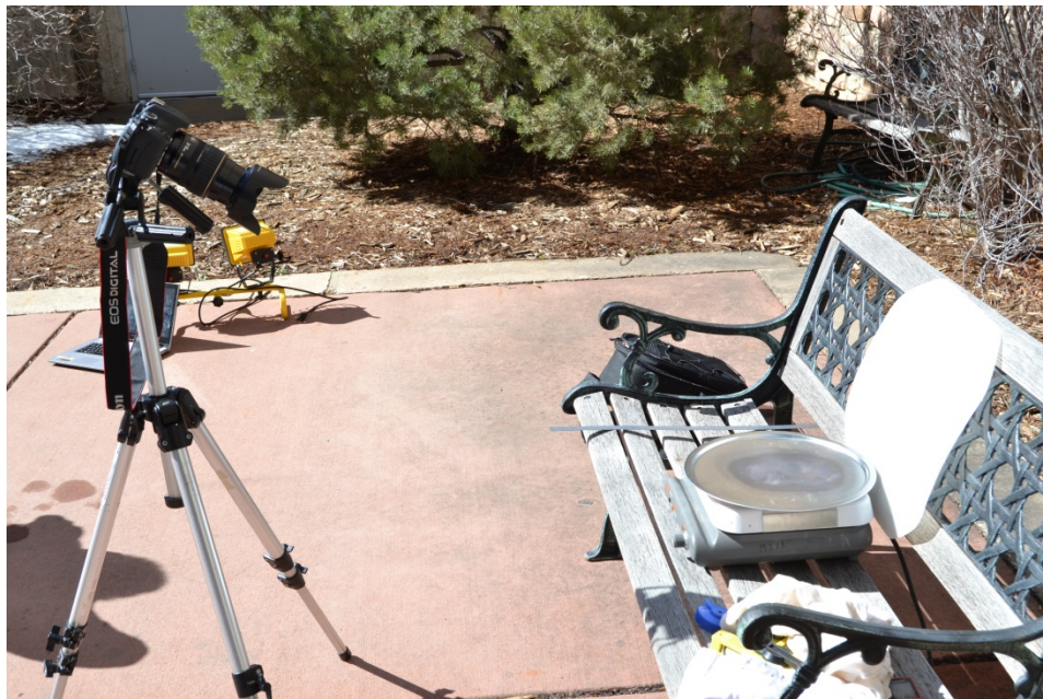
Setup for capturing the Leidenfrost effect.