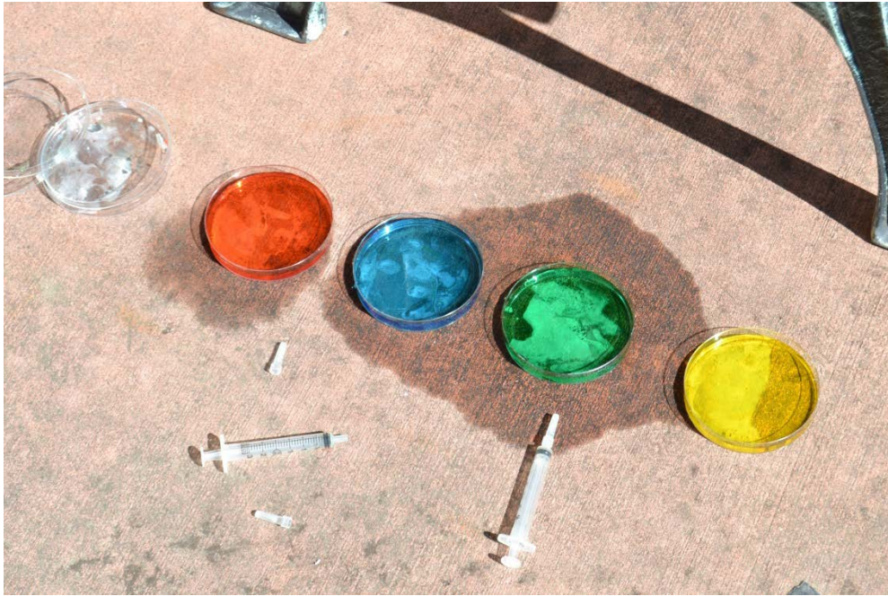
Clear and colored water drawn up with syringes and dropped onto the pan.