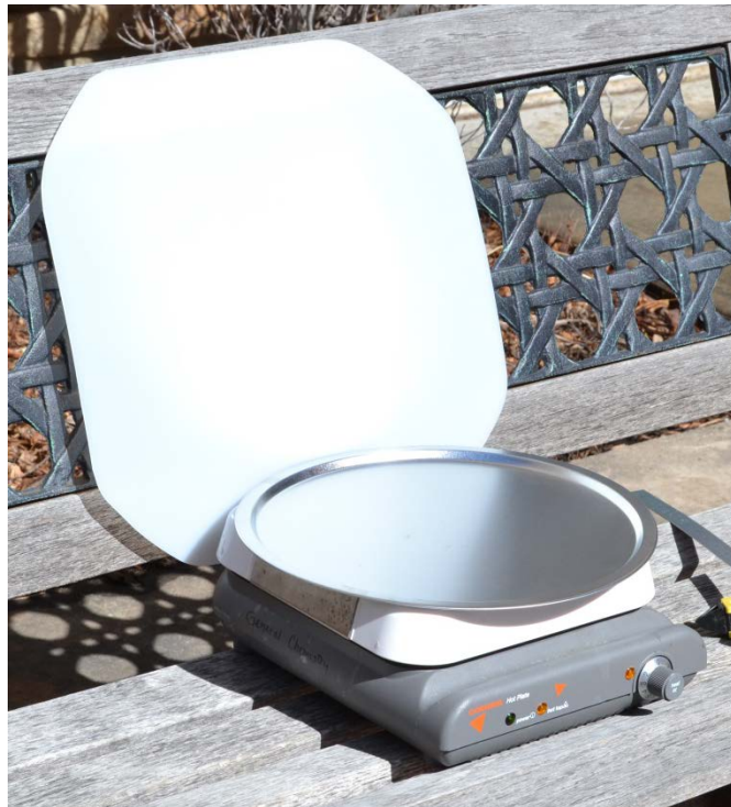
Setup for visualizing the Leidenfrost effect.