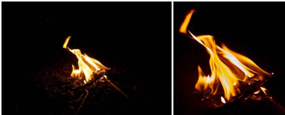
Figure 2. Shows the flame before and after the photo editing

To create the best scenario for photographing the flame, the picture was taken at night. Photographing at night helped ensure that the flame as only light source in the photo. The photo was taken with a Nikon D60 camera. This was used in collaboration with a Nikon DX 18-55 mm lens. To capture the flames in motion, 1/200 shutter speed was used. An aperture of f/3.5 in coordination with an ISO of 800 worked well for the lighting provided by the flame. The distance from the fire was 1 foot away. Photo editing was done with iPhoto. The contrast and exposure were slightly adjusted to enhance the flame color. Sharpness was also increased to get a more focused image. A great deal of editing was done to edit out the majority of the sticks from the photo to focus on the flame itself. The original and post-processed photo can be seen below.