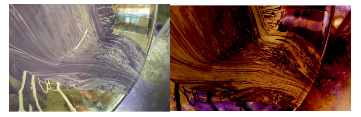
Figure 2: Left: Original image, Right: Final image