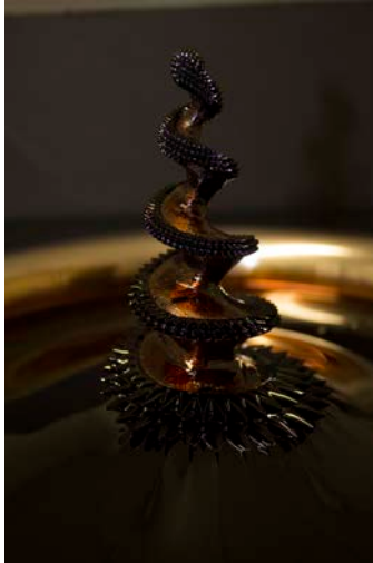
Figure 4: Original Image