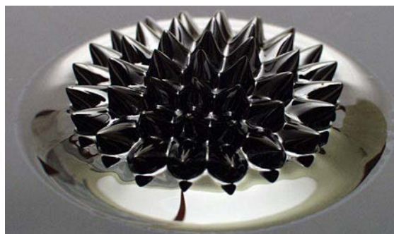
Figure 1: Ferrofluid displaying peaks and valleys due to the normal-field instability. i

A ferrofluid is a type of liquid (usually oil or water) that contains nanoparticles composed of iron. A surfactant is then used to prevent the iron particles and liquid separating from one another. When a magnetic field is introduced to the ferrofluid, the ferrofluid will form peaks and valleys (Figure 1) that give a graphical representation of the magnetic field lines passing through the liquid. i The fluid will be most attracted to areas with a high magnetic flux, and the peaks will point in the direction of the field lines. These peaks and valleys are formed due to an effect known as normal-field instability, which states that the peaks and valleys are the lowest energy formation for the fluid. The spikes in the ferrofluid drive the magnetic field further, whilst surface tension and gravitational forces tend to stabilize the flow. ii The balance of these forces results in the static spike structures distinctive of ferrofluid. It is also important to note that the peaks are where the magnetic field lines are concentrated by the ferrofluid. When the magnetic field is removed, the ferrofluid returns to its liquid state.