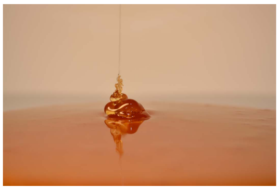
Figure 2: Original Image

The image ended up being slightly overexposed. In post-processing in Gimp 2.8, the curves function was used to adjust the saturation of the image. Unsharp mask was used to further define the image reflection and bring out the edges of the coils. It was cropped to be completely centered and have a vertical concept that highlighted the reflection of the honey. Vertically, the image was cropped using the rule of thirds such that the horizon of the honey pool was a third of the total vertical height of the image. There is some motion blur in the honey coiling, but the unstable nature of the coils can be seen.