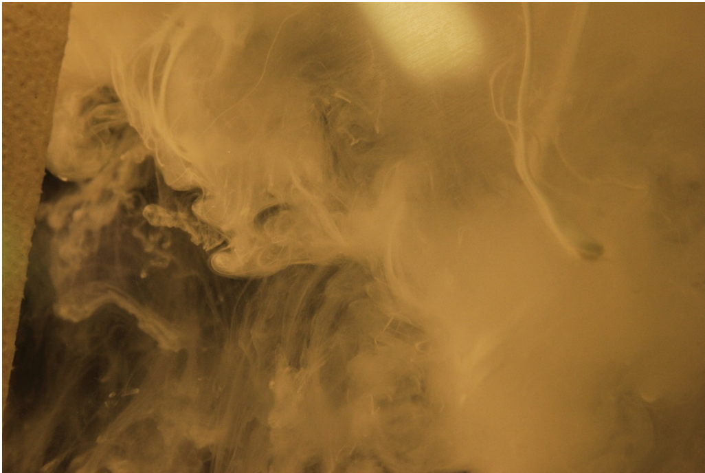
Figure 3: Unedited photo

vignette was also added to cause the viewer's eye to be drawn to the center of the image where all the detail lies. The final product can be seen on the title page, and the unedited photo can be seen below in Figure 3 .