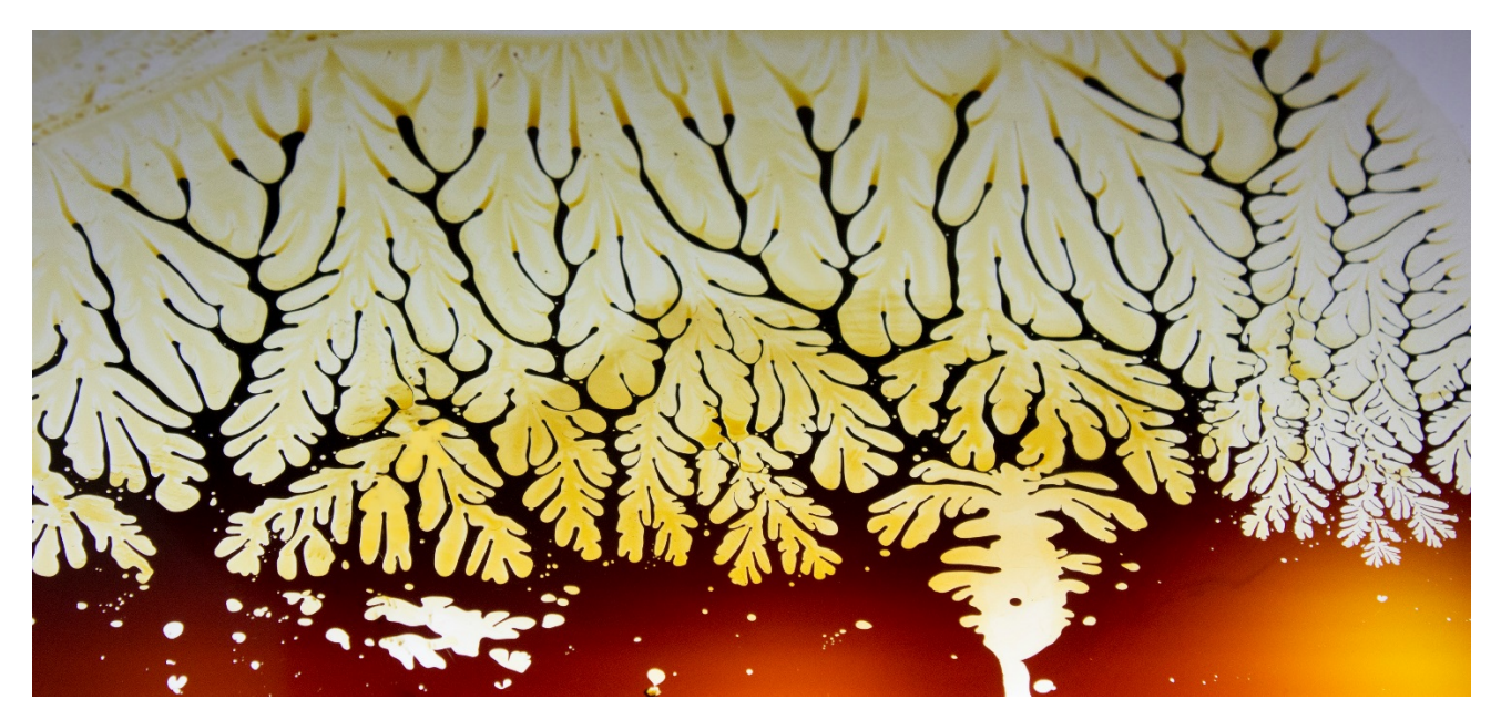
Fig: 1 'Inverse Forest' - Final picture portraying Saffman-Taylor and Rayleigh-Taylor instabilities (and many other things).