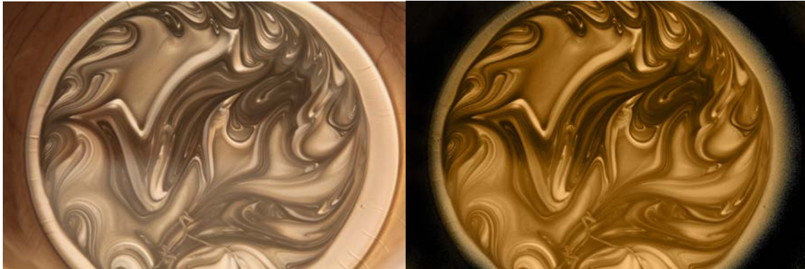
Figure 1: Before and After Post-Production

perimeter of the crockpot to be a distraction of the flow happening in the wax, so I used the brush tool in Photoshop to blacken this out. I felt the fade at the edge of the black and the orange furthered the planetary feeling of the image. In the following figure, the original image can be seen side-by-side with the final image after post-processing.