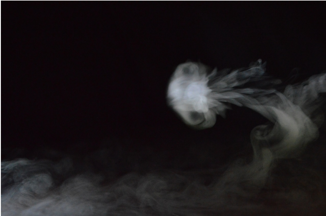
Figure 4: Original Image

The field of view in my final image is about 18"x11". The distance from lens to vortex is about 1'. The lens used was a Nikon Nikkor 18-55mm set to a focal length of 32mm. The camera used was a Nikon D3200 DSLR. The aperture was set to f/4.8, with an exposure of 1/500 second, and an ISO of 6400. I settled on using a shutter speed of 1/500 second in order to freeze the motion in the image. Using such a fast shutter speed and poor lighting forced me to use an ISO setting of 6400. The high ISO setting led to the graininess of the photo. The original image was 6016x4000 pixels, but was cropped down to 5988x3598 pixels. No other editing was done to the image. The original image is shown below in figure 4.