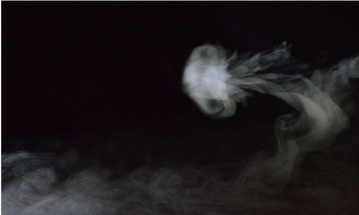
Figure 1: Final Image for Third Team Image Assignment

This image was taken to fulfill the requirements of the third team image assignment for the Flow Visualization course at the University of Colorado at Boulder. My team decided to work on our own projects for this assignment, so I took this photograph on my own. My intent in taking this photograph was to capture an artistically interesting vortex.