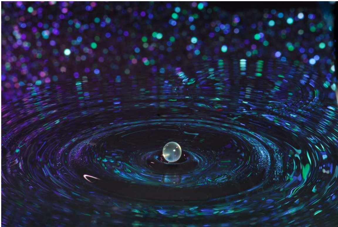
Figure 2: Original Image

The camera used to take this image was a Nikon D200 DSLR with a 105 mm macro lens. The dimensions of the original image are 3872 x 2592 pixels and the edited image dimensions are 2508 x 1702 pixels. The focal length is 105 with an f-number of 18. Because there was motion in the image, the shutter speed chosen was important in order to decrease motion blur. I found that the shutter speed used (1/60 s) was sufficient to capture a crisp, clean image. I needed good focus, and the high ISO allowed for a large enough exposure time. I estimate that the subject was approximately 8 inches away from my camera. The editing technique used was iPhoto. I did not do a great deal of editing. I increased the saturation to get brighter colors and cropped the image so that the single droplet was the primary focus. I also lowered the shadows setting to lighten it. Figure 2 below shows the original image.