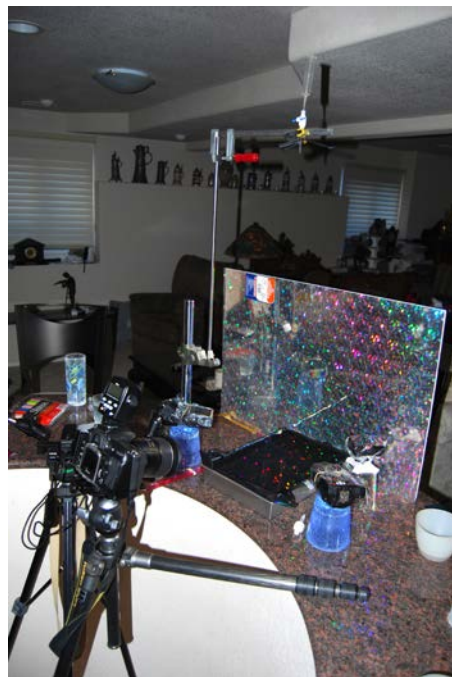
Figure 1: Photographic Set-Up

The set-up for this image was more complex than in previous images but easily reproducible. I placed a one-inch deep black pan on top of a counter and filled the pan to the brim with tap water. I then held a pipette full of water about 24 inches above the surface of a pan and rapidly dropped the water to create the jet. I had two external flashes set up and my camera was placed on a tripod roughly 8 inches away from the subject. I placed a multi-colored, glittery poster board behind the subject in order to get the colored reflection in the water and add an interesting element to the image. There were over 200 photos taken before I captured one I was satisfied with. I wanted to capture a droplet in its full spherical form. The one I captured in my image resembles a crystal ball and perfectly displays the ripples of the water droplets hitting the surface of the still water. The lighting used was two external flashes and the camera flash as the rest of the room was completely dark.