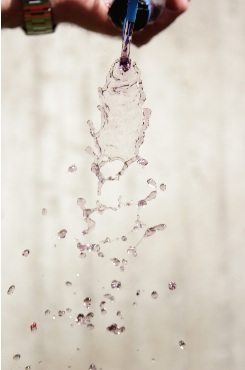
The unedited image.