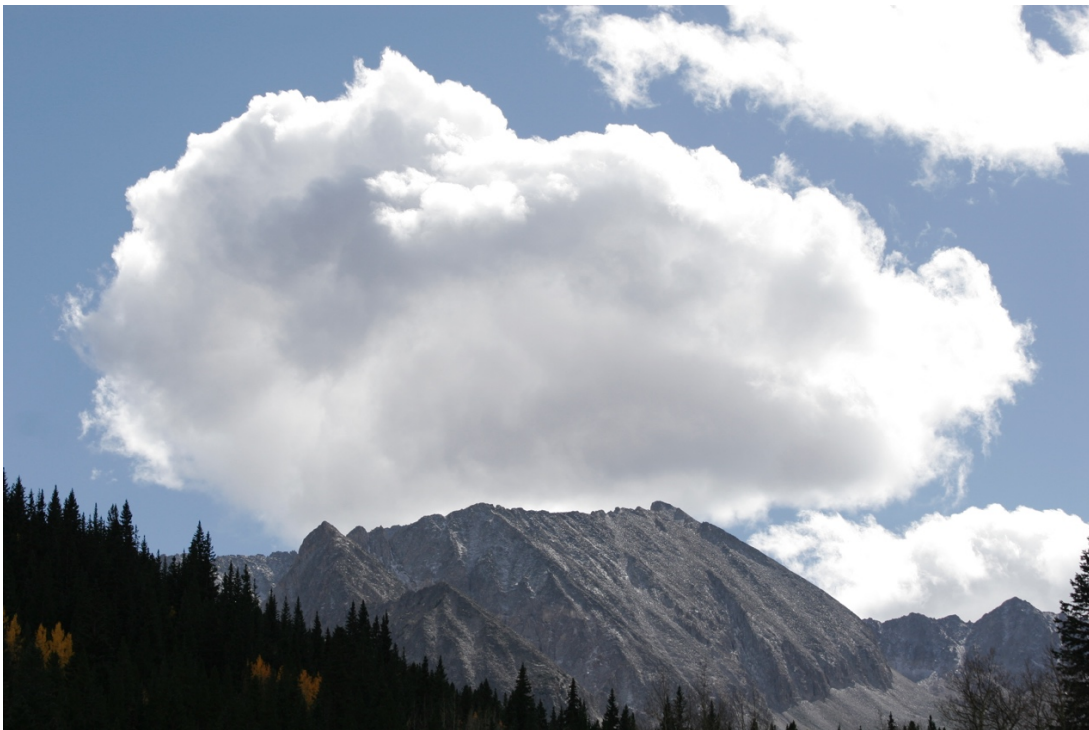
Figure 2: The original picture before any editing was done.

Taylor Peak's summit is at roughly 4000 meters, which is the start of an unstable area from Figure 1. Just above 4000 meters, the dew point and temperature come very close together in the unstable area. This correlates very well with what is seen in the image, which is shown in Figure 2. We can see in the image that the cloud is very close to the summit of Taylor Peak and according to the Skew-T diagram, perhaps 2000 meters separates the two. Figure 1 also states a cape of 238, which suggests instability. This instability is a result of the temperature line crossing the parcel lapse rate curve. This instability could result in a cumulus cloud, but it should be stressed that the Skew-T diagram is from an area that is far away and from 4 hours later in the day. The fact that this was taken in a valley could also be a source of criticism when comparing the Skew-T and the image because small weather systems are quite prominent when they are isolated in the mountains.