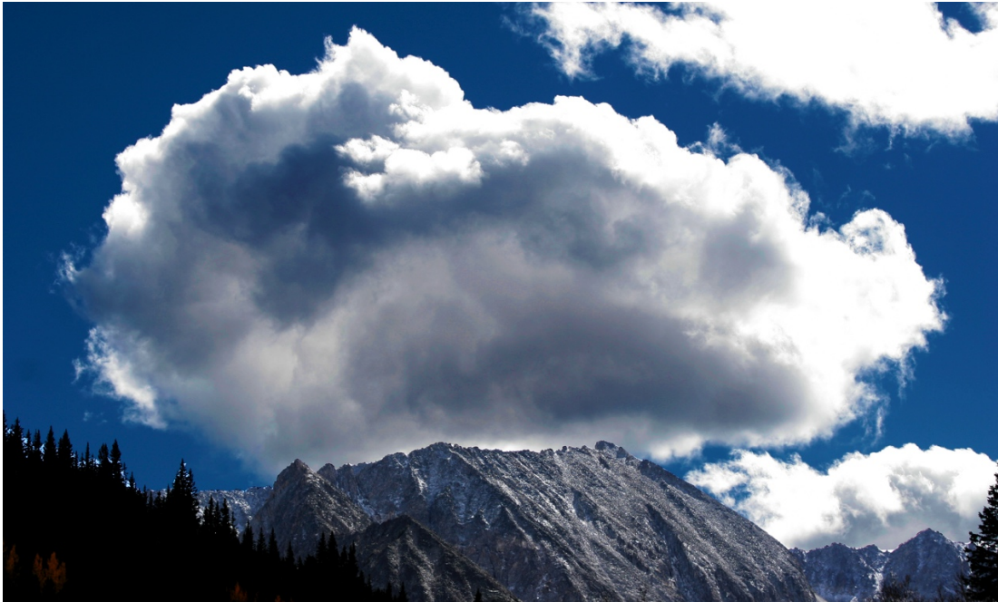
Figure 3: Edited version of the image.

stated that there wasn't any precipitation the day this photo was taken. This is due to the air temperature gradient being relatively small compared to nimbus type clouds. The original image reveals some interesting phenomena, but Figure 3 might reveal even more due to the color and contrast adjustments.