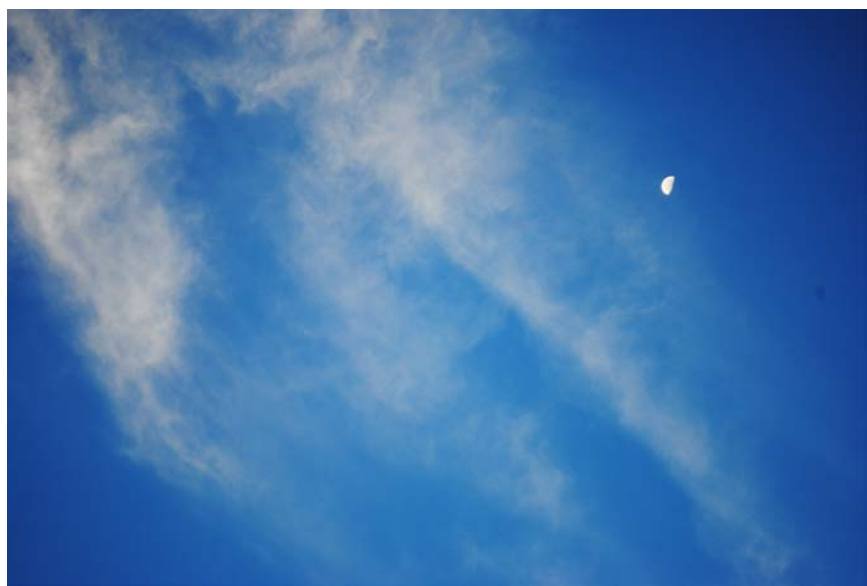
Figure 3: Image after post processing

Minor post processing was performed on the image using Photoshop Elements. The saturation of the image was increased to about 25% to bring out the rich blue of the sky, especially through the wispy cirrus cloud. The brightness of the image was also increased to make the whites of the moon and cloud more prominent, but it was quickly determined that increasing this image too much produced an undesirable washed out look to the image. The increase was kept low, about a 9% increase over the original.