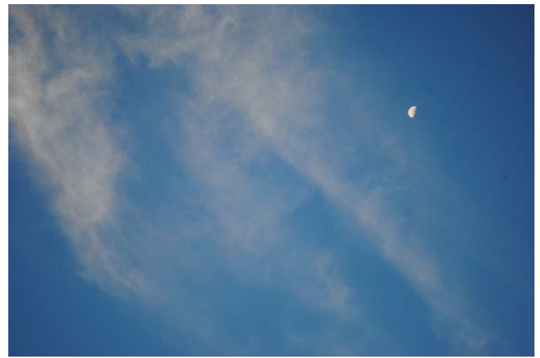
Figure 2: Original image

Minor post processing was performed on the image using Photoshop Elements. The saturation of the image was increased to about 25% to bring out the rich blue of the sky, especially through the wispy cirrus cloud. The brightness of the image was also increased to make the whites of the moon and cloud more prominent, but it was quickly determined that increasing this image too much produced an undesirable washed out look to the image. The increase was kept low, about a 9% increase over the original.