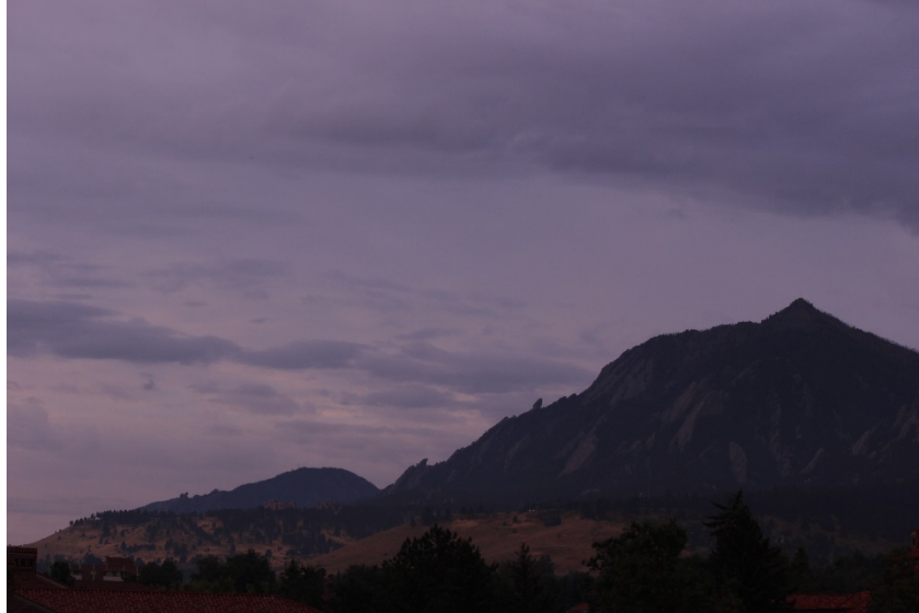
Figure 2: Unedited image of surrounding area at same time and location as final image.