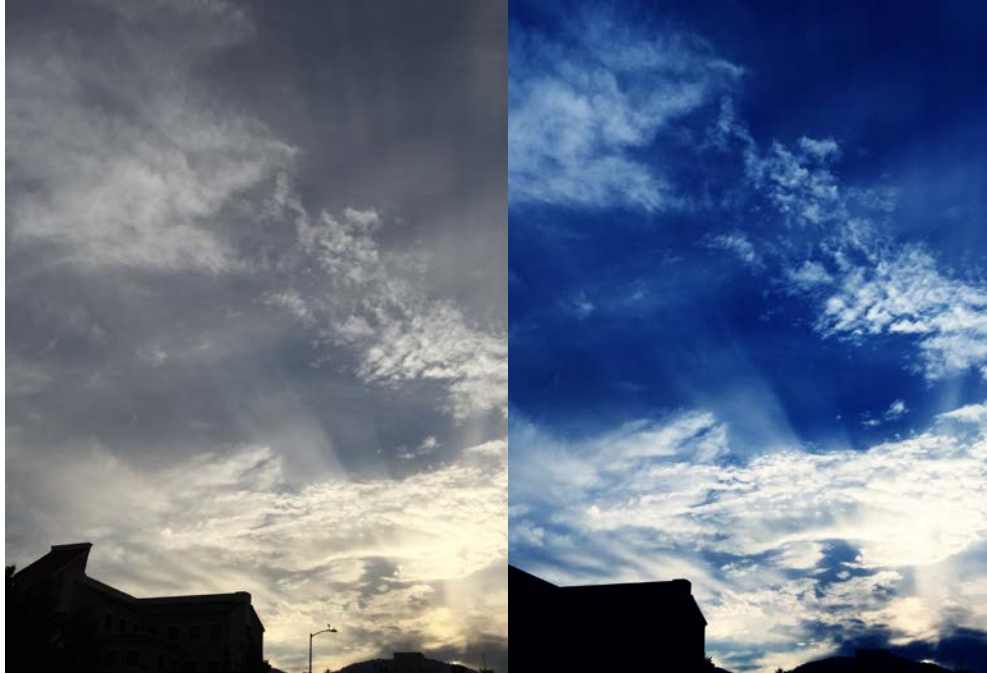
Figure 2 Before post processing on left, after post processing on right

This image is a good example of orographic altocumulus clouds on a clear day. You can visibly see the layer of clouds over the mountaintops produced by the orographic effect. I also like the effect that the crepuscular rays have on the photo. I wish the photo had a wider field of view to capture more of the sky. In the future getting a better vantage point to shoot from and maybe going for a more panoramic effect would produce a better image.