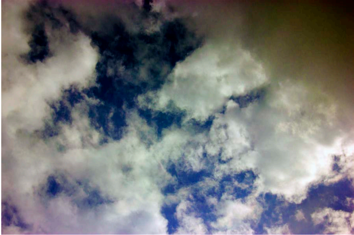
Superior, CO Oct. 3rd 2015 3:35 PM

For this project, Clouds#1, I intended to take picture of clouds that looks most interesting to me. Among all the images that I captured for this assignment this image appeared to be more interesting to me because it feels like I am trying to capture the sky rather than clouds. The way that clouds are broken and it reveals the sky was very unique.