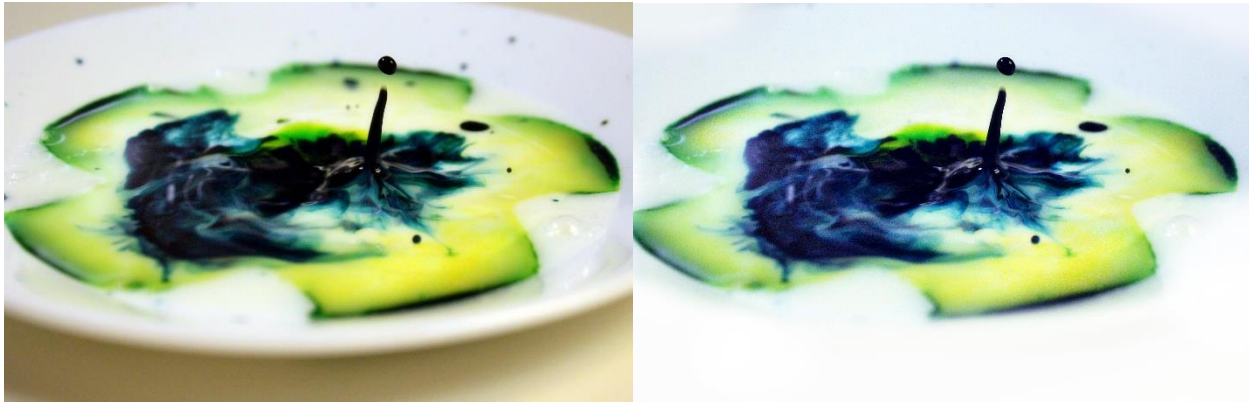
Figure 2: (Left) Before Post Processing, (Right) After Post Processing

The camera I used for this experiment is a digital Canon EOS REBEL T1i with a standard kit lens. I captured this shots from approximately 6"-8" away with an estimated field of view of around 10" x 8". Figure 2 shows the before (left) and after (right) post processing that was completed.