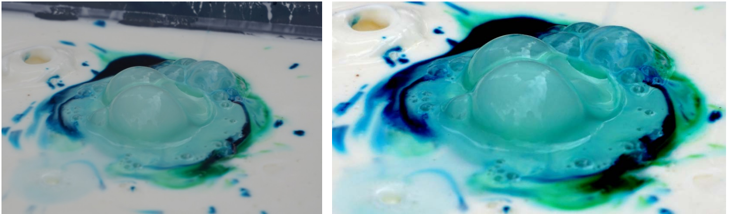
Figure 3: Raw image (left) and processed image (right)

Use of an open – source photo editing program Gimp was then used to create the final image. The image was cropped to focus only on the phenomena (the bubbles and geysers) and to get rid of the container and backdrop. The image was then saturated a little but most importantly the contrast was increased to make the bubble stand out more against the bright, white oobleck. The post – processing after image is also shown below in figure 3: