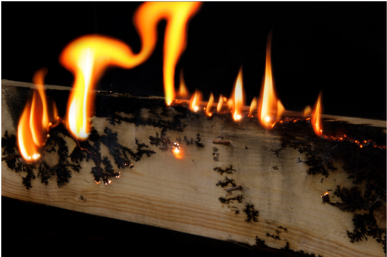
Figure 1: Final, edited image