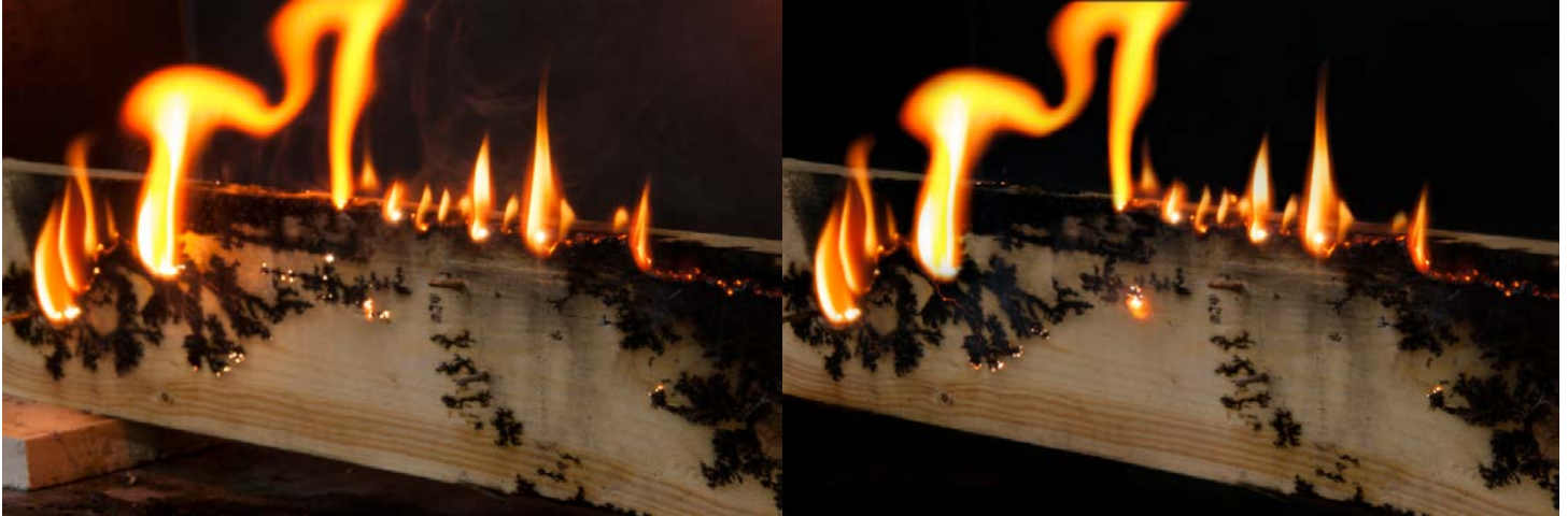
Figure 4: Comparison of before editing (left) and after (right)

motion of the flames, and to increase the exposure since the previous two settings significantly dropped the light level. One of two raw images used to make the final composite is shown below in Figure 4 (left). The two original images are almost identical, excepting a slight difference in time and focus, which made their composition fairly simple, even with only a little Photoshop experience.