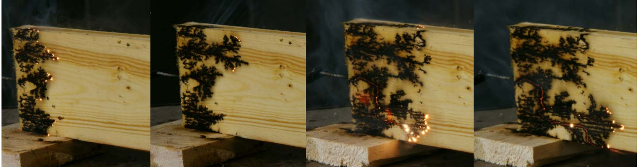
Figure 3: Close up time lapse of Lichtenberg figure growth

current and the figures in this experiment were produced with alternating current, many general principles remain the same. As was shown during the experiment, streamers of electric charge emanated from both contact points within the wood. They grew steadily toward each other, branching out in various directions in accordance with subtle, seemingly random changes in resistance. In general, the fingers appear to follow paths along the grain of the wood as shown in Figure 3 below. This phenomena could be explained by the vascular structure of the wood. That is to say the grain of the wood is a result of the tree's xylem, which is used to transport water via capillary action. 4 These channels probably help to wick the electrolyte solution through the wood, making those paths more conductive to the electricity.