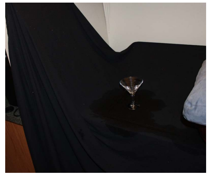
Figure 2: Image of actual setup