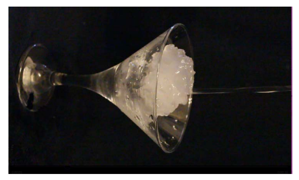
Figure 4: Image taken from original video

The video editing was performed in Windows Movie Maker 6.0 with the intent to make minor adjustments to the original video in order to enhance the understanding of the phenomena. These adjustments were to rotate the video 90 degrees so that it was facing upright, and to slow down the speed of the video to half speed in order to allow a better understanding of the phenomena occurring. When the video played at the original frame rate, the state change and motion were occurring too fast for a clear visualization of the nucleation and much of the detail was going unnoticed with the high playback rate. All other video elements, such as lighting, color, and vibrancy remained the same as the original video. A final addition was added to the movie in order to put a crowning finish on the movie. That was to include an original score composed by Daniel Morrison specifically made for this video. The original video for obvious reasons, could not be included in this report but an image extracted from the original video can be seen below in figure four.