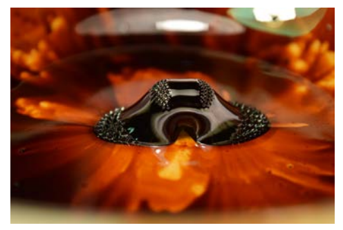
Figure 2: Original Image

After the picture was taken I used Adobe Photoshop to help develop my final image. I first cropped out the reflections of the lamplights on the top of the bowl. I then played with the curves of the image. There is an auto function of the curves menu, which I used. I automatically changed the reds, blues, and greens of the image. This really brought out the darkness of the ferrofluid. It also made the combination of the white surface of the ceramic bowl and the thin layer of ferrofluid much brighter and almost more orange. You can see the differences between the original photo (figure 2) and the final image (figure 3).