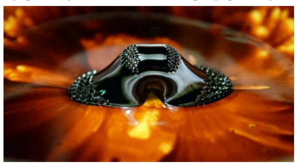
Figure 3: Final Image