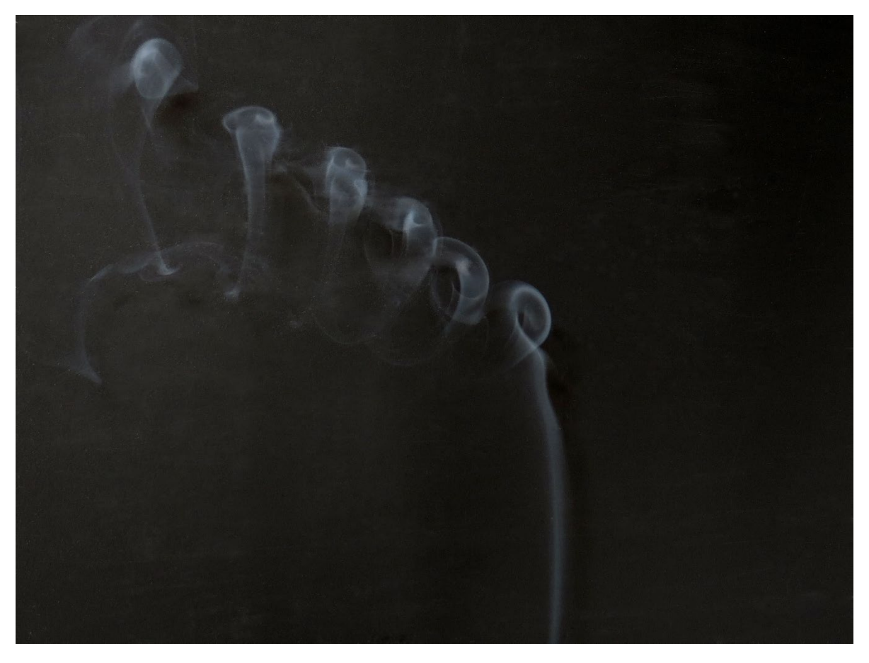
Second Team Write Up