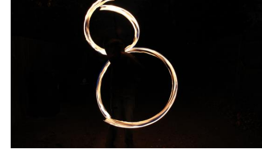
Figure 2: Spinning flame 1

As a team, we captured nearly 100 images of the spinning and juggling flames, but none of them really caught our interest. After this disappointment, we started taking high shutter speed images of a more stable flame. The final setup used in the image was an aluminum baking tray with about 75 mL of kerosene in the bottom of it. Because the evening was so calm when we captured these images, the burning kerosene produced a tall, nearly vertical column of flame. At its peak, the flame column reached nearly 1.5 meters in height. The kerosene fuel burned very steadily and for about 2 minutes before it had all combusted. A very striking element of this specific picture is the spiral swirls on the right side of the flame column. In order to fully understand the flame column and these spirals, we must examine the combustion reaction.