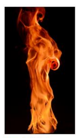
Figure 4: Edited

Post processing was an easy process for this image. Because the background was so clean, all that was needed was cropping the image, and dodging the areas I wanted to highlight. I upped the brightness a little, and then used Photoshop to dodge the uppermost vortex, and the vortex halfway up the image. Because flames are so complex, this process took a lot of time because going overboard with the dodge tool looked very bad.