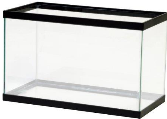
Figure 1 - Ten Gallon Fish tank, similar to one used in trials.

As seen above, a ten-gallon tank was used for the creation of this photograph. The latex paint was dropped from a tube into cold water in the tank. Some latex paint would diffuse into the water in the tank, but most would travel down to the tank floor and sit there. The water was then drained into a kitchen sink. At this point the paint would begin to travel down the angled surface of the tank floor, being forced by the exiting water flow. The paint on the floor of the tank was much more viscous than the water exiting, so the paint was left at the bottom when all the water had been drained. When all the water had been drained, this allowed for good opportunities to photograph the flow that I submitted.