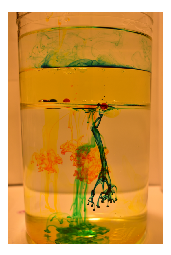
Figure 2: Original Image