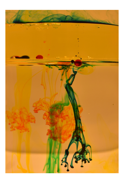
Figure 3: Final Image

For the original image shown above in Figure 2, the field of view was chosen to depict all the fluids from the bottom layer to the top layer. The camera was setup eight inches away from the container in order to frame the image at a focal length of 29mm. The type of camera used was a digital Nikon D3400 DSLR with a 18-55mm lens, which captured a 4000 by 6000 pixel original image, later edited down to 2834 x 4082 pixel image. The aperture was set at f/5.6 with a focal length of 29mm at a shutter speed of 1/10 second. A low ISO of 200 was used to ensure minimal the noise would appear in the image. The image was captured as a JPEG image, and edited in Photos to crop the image and focus in on a specific region. The final image is shown below in Figure 3 which was cropped to draw more focus to the interaction between the three fluid density layers to eliminate view of empty space in various parts of the fluids and the distracting background. This edit was also performed to capture a better section of the Rayleigh-Taylor instability.