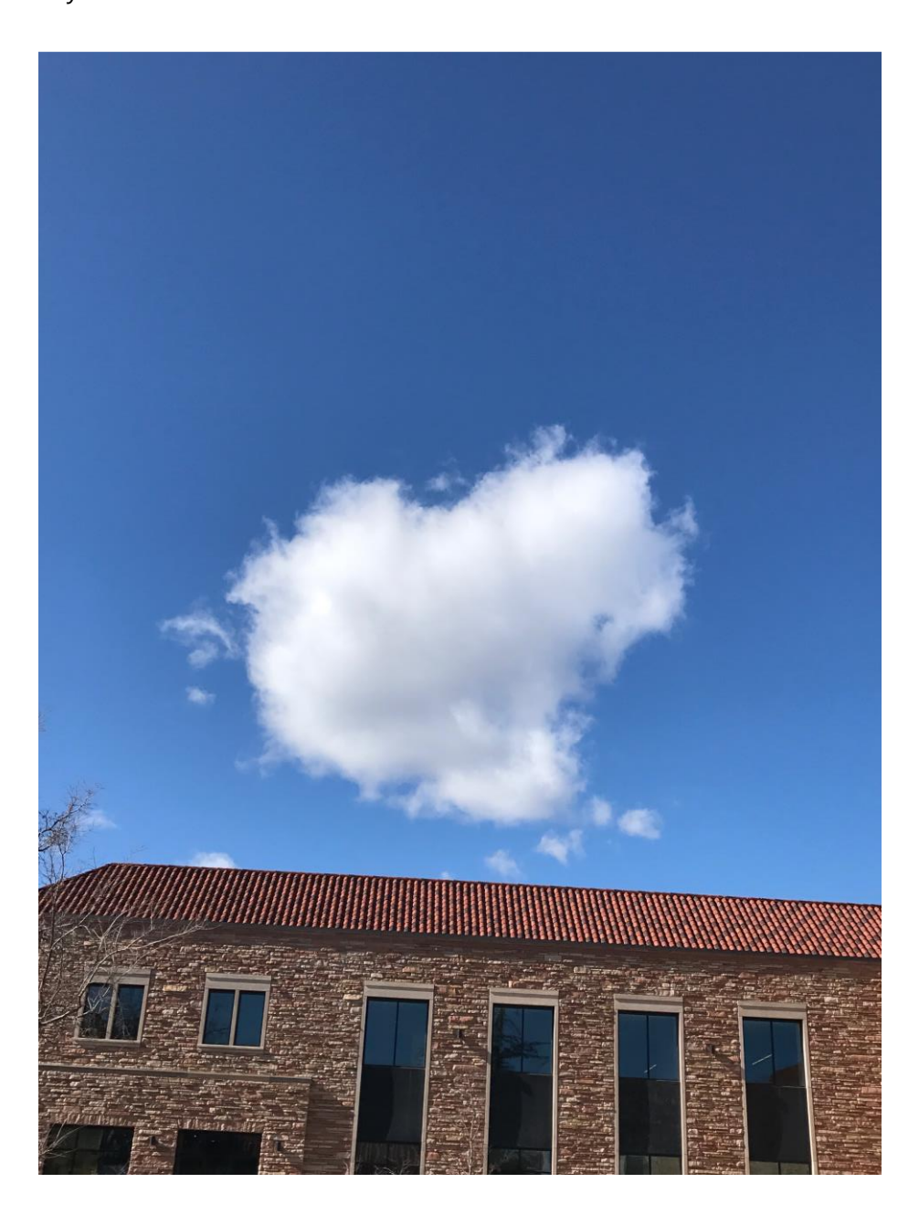
Figure 1: Pre-Photoshop/Original Image

I captured a picture of cloud. The phenomenon I found a fluffy cloud right above the REC center and I decided to use that cloud as my submission of Cloud First Image. I wanted to make the cloud fluffy in the image, so I focused on the surface of cloud and make the cloud at the center of frame. The sky was clear and very bright blue, so the cloud was seen very well.