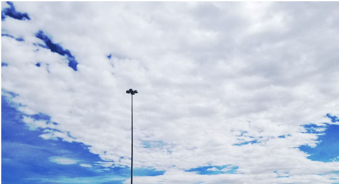
Figure 1: Final Image

For my second clouds image, I wanted to capture something with more color, and more clear cloud definitions, rather than the dark and blending tones of my first. I saw these clouds over US 36, and immediately found the bright blue sky behind this blanket of Stratocumulus eye-catching. This image was taken on an relatively clear afternoon, save for these cloud bands, heading east towards Denver on March 22, 2018 (stopped in traffic near Federal Blvd).