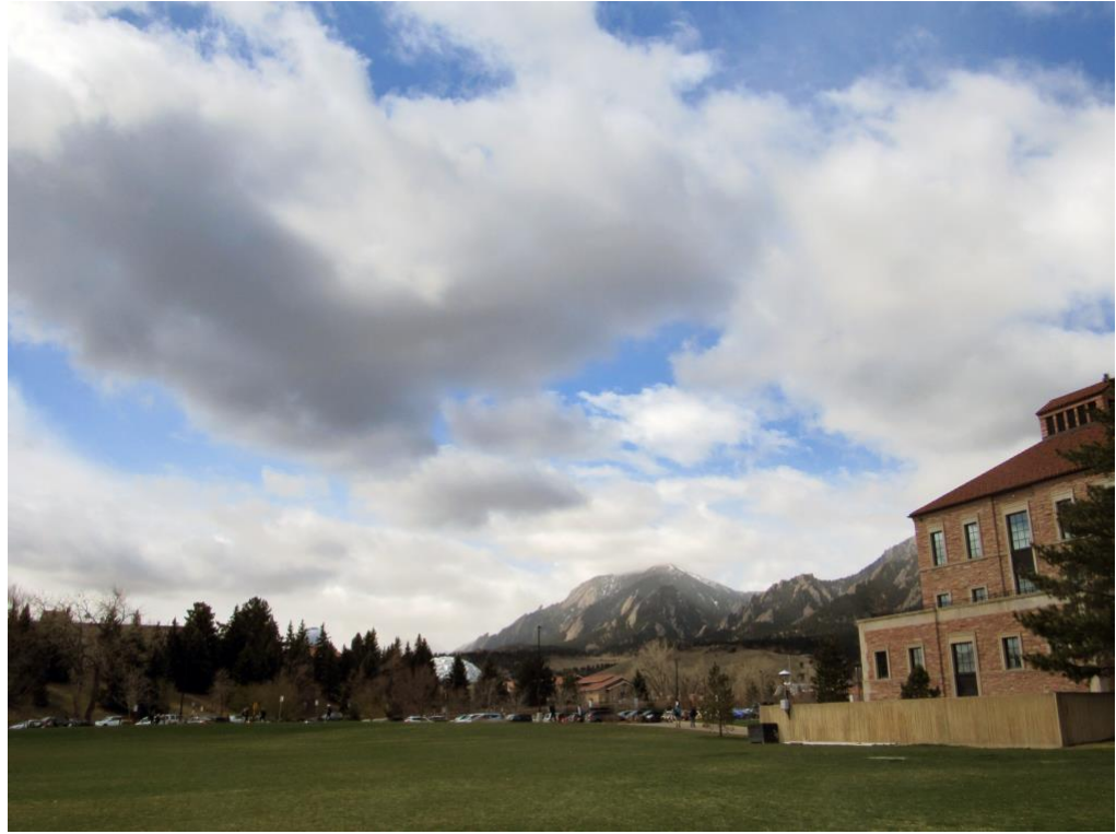
Figure 1: Image of clouds above Flatirons

The image contained in Figure 2 below, is my submission for the Clouds Second Assignment for MCEN 4151: Flow Visualization. The image contains a number of different clouds that were formed as a result of a storm system that had passed through the Boulder, Colorado area in the previous 24 hours. The intent of this image is to reveal to the beauty in clouds from in unstable atmosphere.