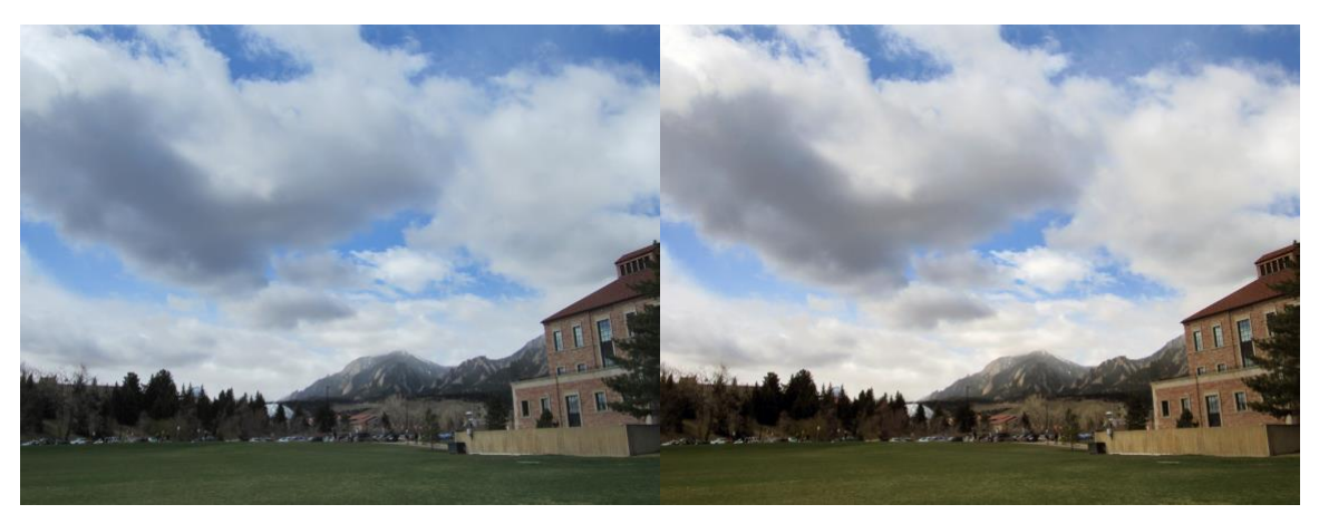
Figure 3: Original image (left), Submitted image (right)

Figure 3 below contains a comparison between the image originally captured by the camera, and the final image that was submitted.