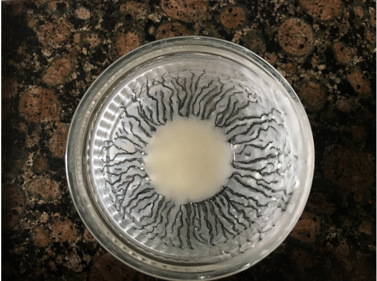
Figure 3: Original Team Third Image.