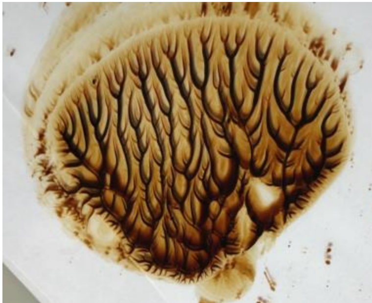
Figure 1: Ferrofluid at max separation of glass plane

The video used for this assignment depicts the phenomena of surface tension and viscosity. Using ferrofluid and two glass planes, interesting patterns were able to be created. Although the ferrofluid was not particularly necessary for the experiment, since no magnets were used, its dark color helped create a strong contrast to easily visualize what was happening. This visually appealing effect was created by placing a glass plane down, pouring a small amount of ferrofluid on it, then placing a second glass plane down on top of that. Separating the glass planes from one side, creating an uneven gap, resulted in a repeatable and appealing pattern. The pattern created was for the most part repeatable as long as the glass was removed in the same way. For example, you can lift the top glass plane straight up, starting from one side, from a corner, etc.