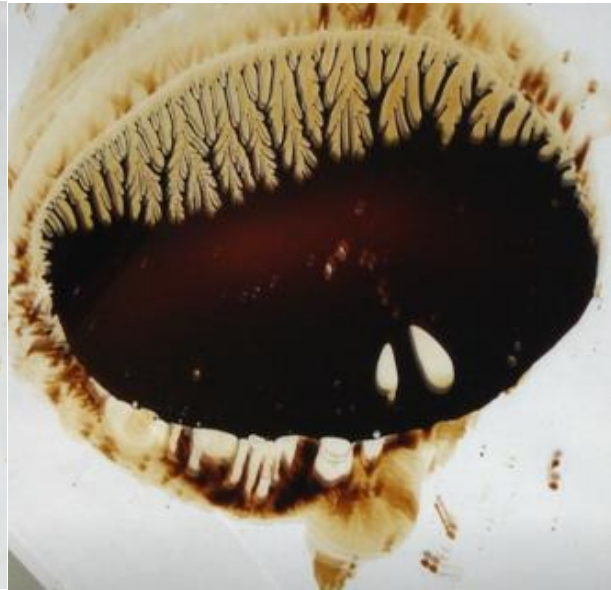
Figure 3: Beginning to separate glass