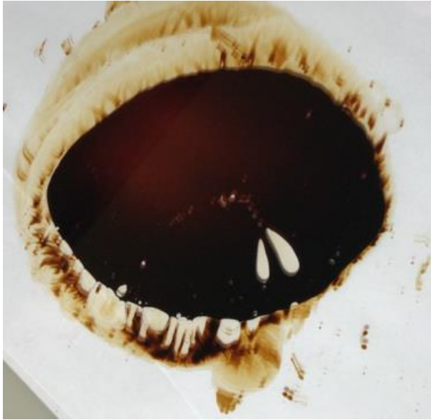
Figure 2: Ferrofluid between glass with no separation

The video was taken on an iPhone 7 camera at 4k with 30 frames per second. It was edited using iMovie and Shotcut. The video has a yellow tint on it and the ferrofluid has a almost black/purple glow for a pop-like aesthetic. The video depicts the phenomena in both real speed and in slow motion for a more dramatic effect.