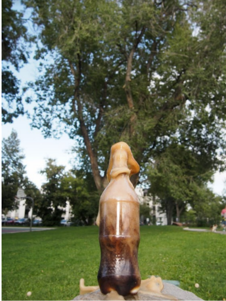
Figure 2: Original Unedited Photo