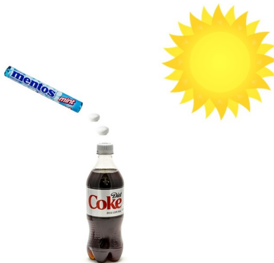
Figure 1: Experimental set up diagram

The experimental setup for this experiment was relatively straightforward. It involved a coke bottle (label removed), Mentos, and a good sunny area. This is shown in Figure 1. The soda bottle contained 16 oz of Coke, and the top had a nozzle diameter of 28mm.