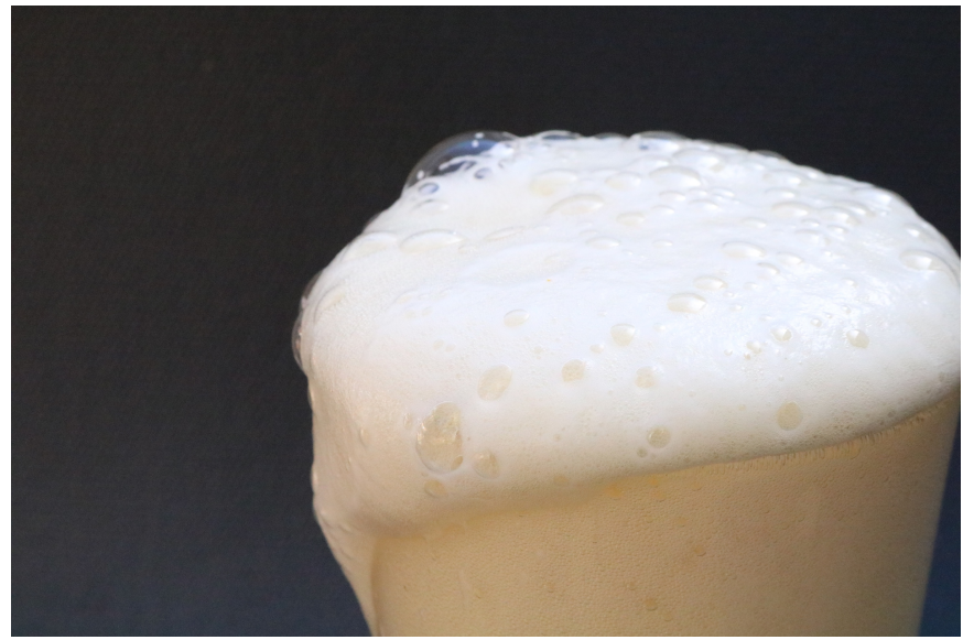
Figure 2: The original image before post processing.

Given the diameter of the glass was 4 inches across, the size of the field of view was about 6 inches across and 4 inches tall. The distance from my camera lens to the object was 2 feet away. I wanted to sit farther away and zoom into the top of the glass to eliminate most of the background. The focal length of the lens was set to 49 mm. I used a digital Canon EOS Rebel T6i camera. The dimensions for the original and edited image was 6000 × 4000 pixels. The aperture was 14, shutter speed was 1/1000, and the ISO was 6400. Figure 2 shows the original image before post processing.