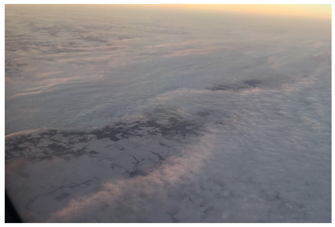
Fig 2. The is the before image which was taken with an iphone SE and is the raw (unedited) photo.

To capture the photo an Iphone SE was used. The phone's camera has a 12 megapixel capability and has an ISO range of 1/3s to 1/8000s. Unfortunately the aperture cannot be adjusted on the phone and the ISO information is restricted. The field of view is estimated to be 2 miles by 2 miles of depth and width. Before editing the raw image was 3024 by 4032 pixels. After editing the image was reduced to 1250 by 886 pixels. In addition to cropping, the photo enhanced the contrast and saturation to create the dark and positive color scheme. One unique technique used was saturation/hue selection or cropping. This allows the region of the earth shown in the section of no clouds to be over exaggerated as green and make the color stand out.