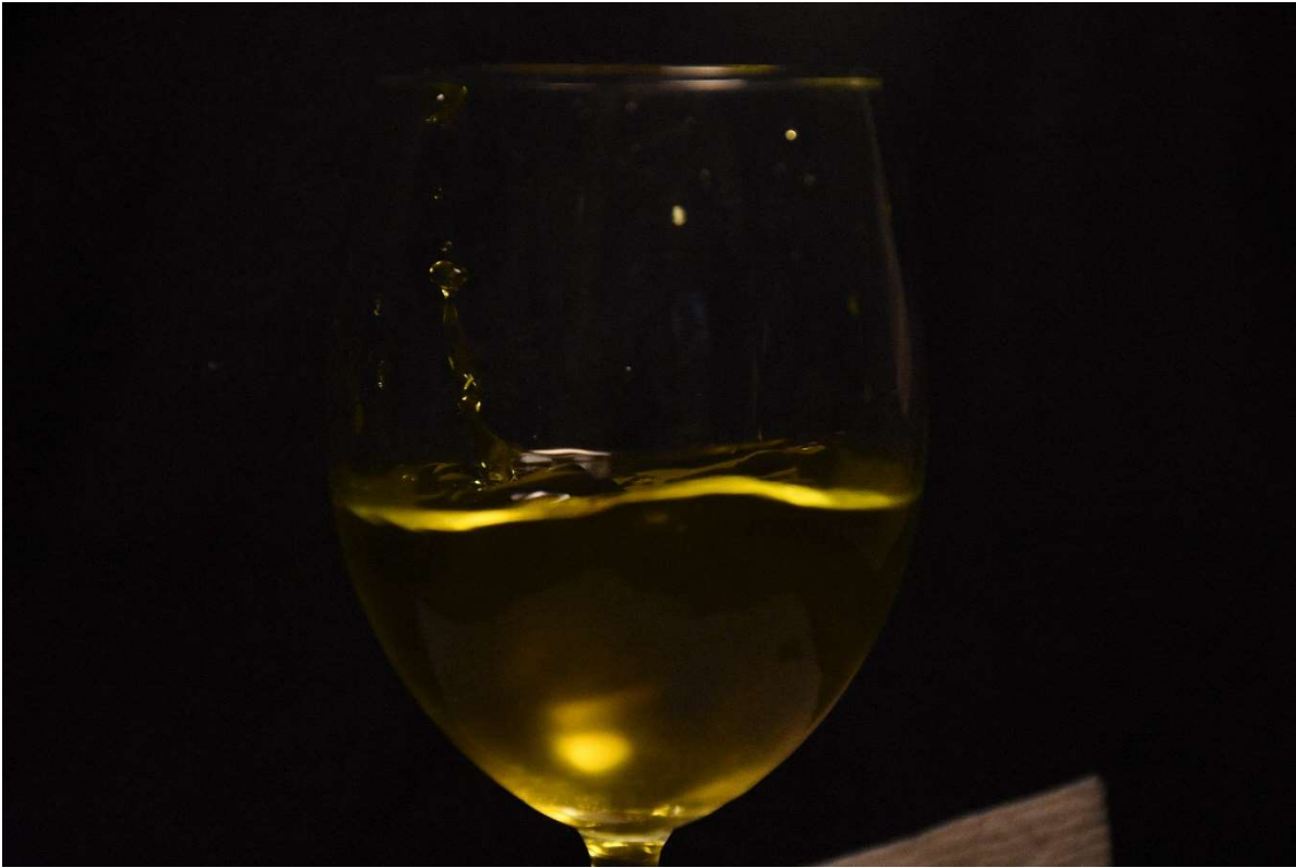
Figure 2: Original, unedited picture

liquid became more pronounced. I do not feel that this detracted from the image or caused any detail to become lost and instead accentuated it.