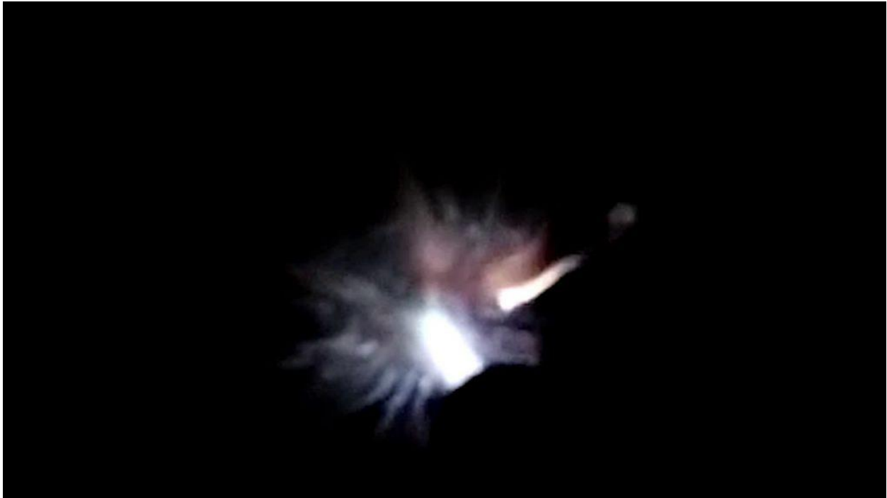
Figure 1: Thumbnail of video used in post

The purpose of this assignment was for students to take pictures of different types of fluid flow which corresponded to the theme that their team chose. My team chose food and fire as the theme for our images, so I decided to take an image of a grapefruit being burned by a butane torch. We chose this because we thought it would be interesting to see how the acidic juices from the fruit would be ignited by the flame and what flow patterns they would create. Additionally, I thought that this would be a cool phenomenon to visualize in slow-motion video format, which was my primary goal for the third installment of our team posts.