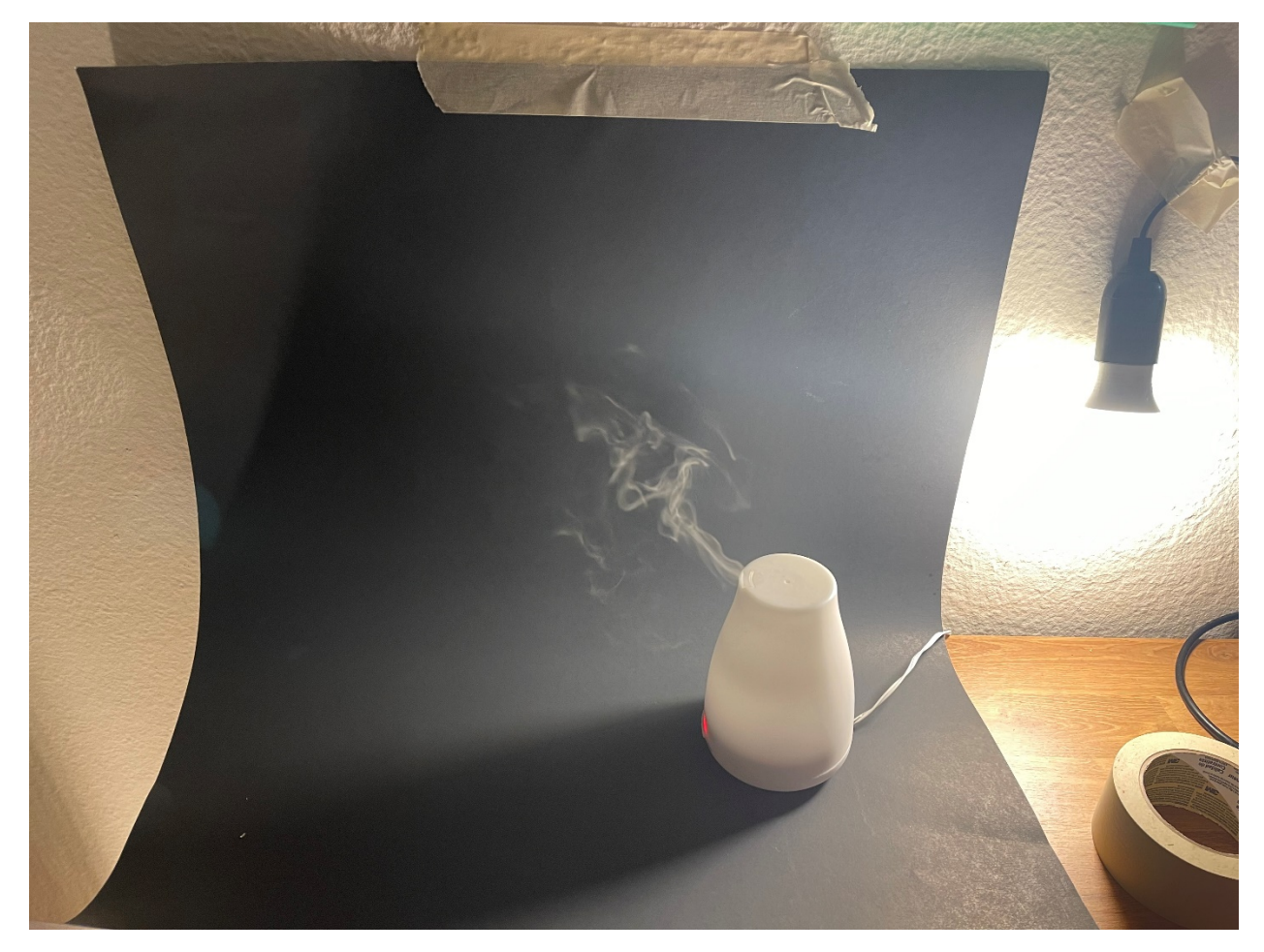
Figure 2 - Experimental setup

This photo was taken indoors with artificial, warm lighting. The fluid exited the diffuser at an upward angle, helping display the effects of gravity. The fluid was water vapor generated by an essential oil diffuser. This water vapor mixed with the ambient air, resulting in the turbulence seen in the image. The background of the photo is a black posterboard, and there are lights on both sides of the setup to emphasize the flow. Importantly, the light on the left side was placed significantly further away from the subject than the light on the right side. This helped the camera capture a clear image of the water vapor. The camera, a Canon Rebel T2i, was placed on a tripod around a foot away from the diffuser to generate this image. The overall experimental setup is shown below: