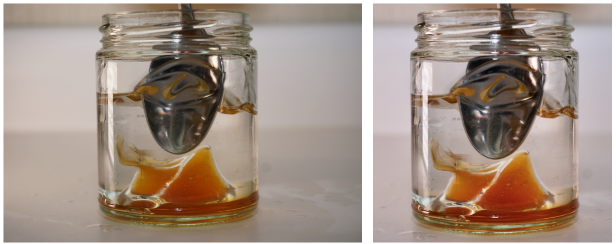
Figure 4: The unedited image (left) versus the final, edited image (right).

and was zoomed to 50 mm. I used an aperture of f/5.6 to allow a lot of light onto the sensor and an ISO of 1200 to balance light sensitivity with graininess. The original image size was 6000 x 4000 px, later cropped to 3840 x 3840 px. The unedited and edited photos are shown below in Figure 4 for comparison.