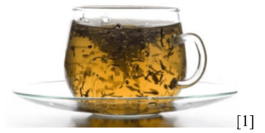
Figure 1: Tea leaves move to the middle of the cup instead of the outside.

In this report I describe the tea leaf paradox and attempt to explain it. If you stir a cup of loose-leaf tea, you will notice the leaves migrate towards the center of the cup instead of to the outside. This is unexpected, because you might think the leaves would move to the edges of the cup without an obvious centripetal force to keep them in the middle.