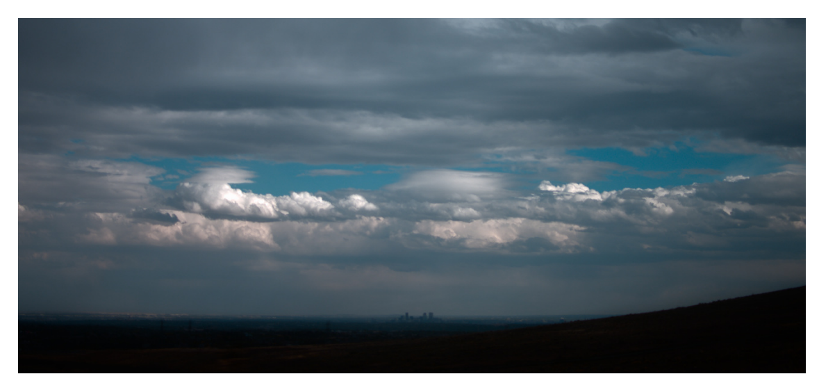
Figure 1: Cumulus and Nimbostratus Clouds over Denver

For this first clouds assignment, students were tasked with taking photos of different types of clouds. One additional requirement was that the photo taken must be within the time frame of August-October 2022, meaning it must have been taken in the time since the class began. The intent behind this particular image was to capture the contrast between the Cumulus clouds and the blue sky elsewhere in the atmosphere. The timing was difficult as I was in a moving vehicle and only had a couple seconds to capture the image.