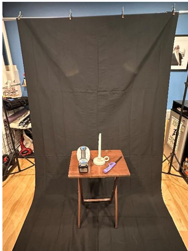
Figure 2 - Apparatus setup.

The flow apparatus for this image consisted of a single household candle mounted vertically on a flat surface. The candle was approximately 25 cm tall, with a diameter tapering from about 2.5 cm at the base to 1.5 cm at the top. The visible flame measured roughly 2.5 cm in height and 0.5 cm in width. A black greenscreen was positioned behind the candle to eliminate reflections and isolate the flame in the final image.