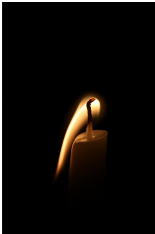
Figure 4 - Original image (jpg) without post-processing.