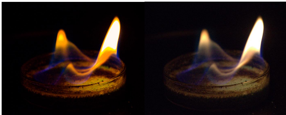
Figure 3: Post processed image on the left, original photo on the right.

This image was taken with a Canon Rebel t3i digital camera. The flame fluctuated while taking pictures, so a faster shutter speed of 1/100 sec was used. The image was taken in the dark with the fuel gel flame the sole source of light, because of that an ISO of 6400 was used to try to capture as many characteristics of the flame as possible. A medium aperture was used (f/5.6) to capture the flame and blur the background, since there was not a larger area to focus on. The focal length used was 300mm at 1 meter away. The calculated field of view was 2.9 in x 1.9 in.