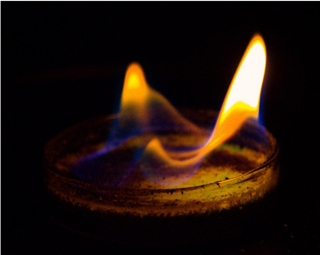
Figure 1. Final image of Fuel Gel Flame