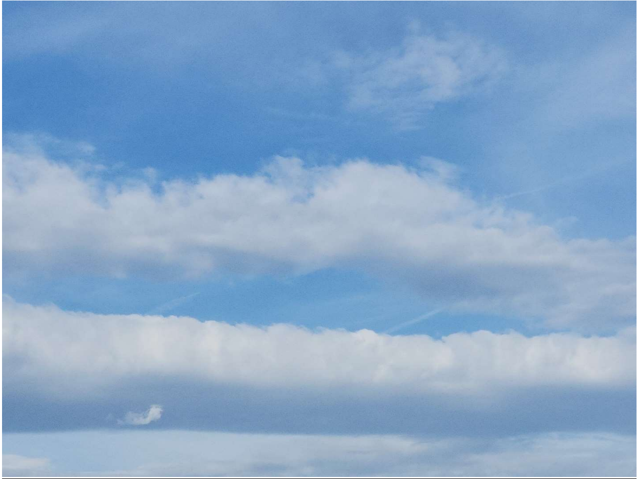
Fig 2. Original Un-edited Photo

The initial photograph was captured using a Samsung Galaxy S22 Ultra smartphone. The photo was taken with the stock camera app with default settings. The focal length used for the captured image was 8mm with a F-stop of f/2.4. The original photo has a width and height of 4000 x 3000 pixels (Figure 2). The final image was cropped to a width and height of 1300 x 639 pixels and slightly rotated to be more level with respect to the horizon. The default Samsung Galaxy photo editing software was used to auto-balance the colors in the photo. Further processing was done using Darktable to further edit the RGB-curve of the image to accentuate the shadows and to crop the image.